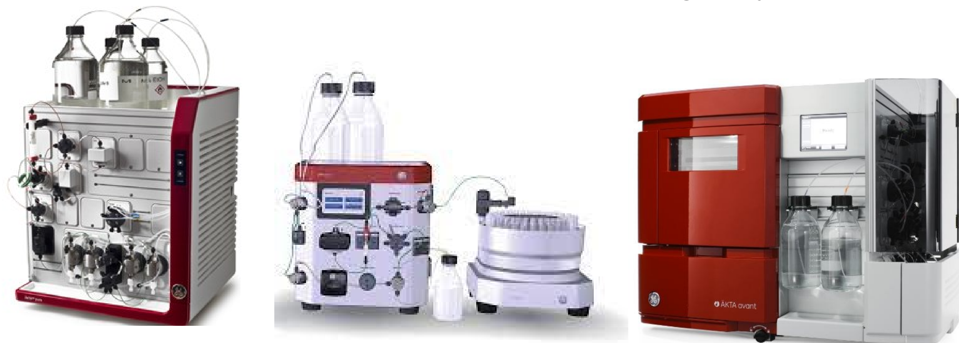
Figure 2. Left to right: ÄKTA Pure, ÄKTA Start and ÄKTA Avant purification systems.