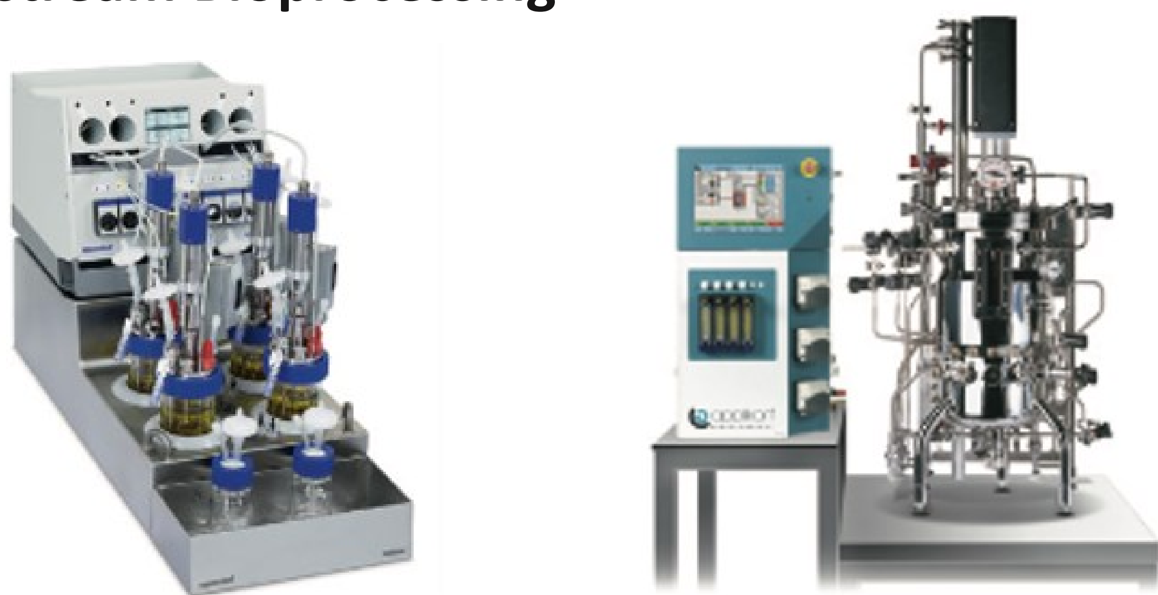
Figure 1. Left: Bioreactor system for bacterial process optimization. Right: 30L Biobench mammalian unit

Microbial: Eppendorf DasBox 8 x 250 ml parallel automated bioreactor units for DOE and process optimization, up to 30 L scale up with Applikon bioreactors.