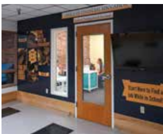
Office of Financial Education