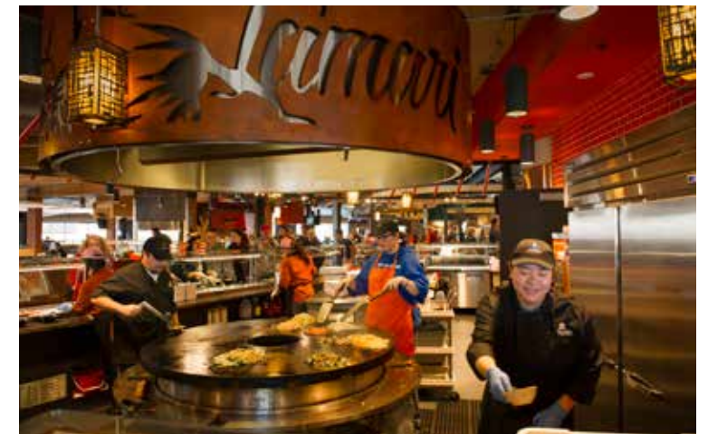
MSU's Miller Dining Commons (bottom right) is the grand prize winner of the international 2016 Loyal Horton Dining Awards.