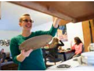
MSU's 11 residence halls give students the opportunity to stay in the center of campus life.