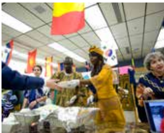
International Street Food Bazaar