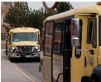
The convenient, safe and free Streamline Bus system.