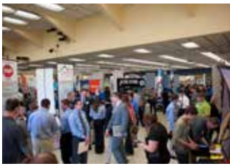
Bi-annual Career Fair