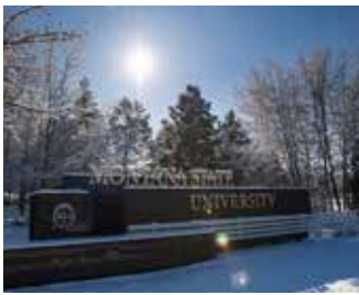
North campus entrance