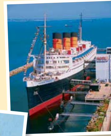
Queen Mary, Long Beach, CA.