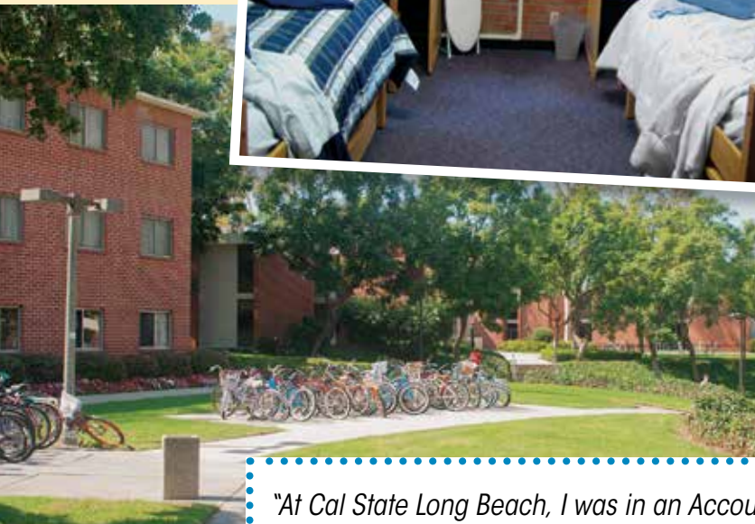
Campus residence hall area

"At Cal State Long Beach, I was in an Accounting society and many other organizations, which helped me make a lot of friends."