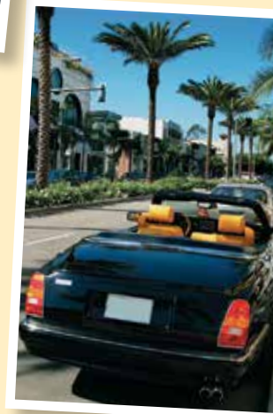
Beverly Hills, California

"Long Beach is the center of many great Southern California landmarks, like Universal Studios and Disneyland. It's a beautiful place."