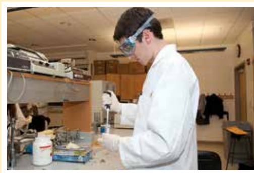
A student in a chemistry lab