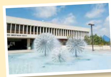
View of fountain with the Pyramid in the background

at www.csumentor.edu . It is best to apply toward the beginning of the filing date as applications are processed on a first-come, first-served basis.