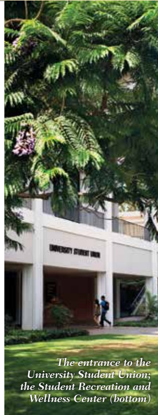
The entrance to the University Student Union; the Student Recreation and Wellness Center (bottom)