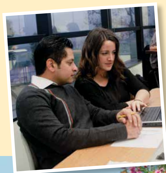
CSULB business students (left and top)

*This estimate is based on fall 2012 fees and prices are subject to change without prior notice. For the most up-to-date pricing, go to www.csulb.edu/internationalfees .