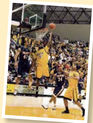
CSULB basketball game

International students can expect to find a warm, welcoming environment at CSULB. From affordable tuition and accessible professors to small classes and a wealth of fields of study, CSULB will enrich your international study experience, helping you reach your educational goals in an enjoyable, unforgettable way.