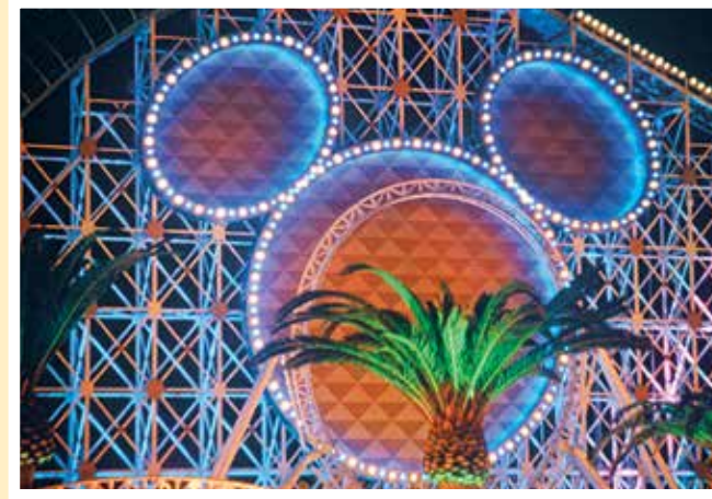
The "California Screamin'" attraction at Disney's California Adventure® Park.