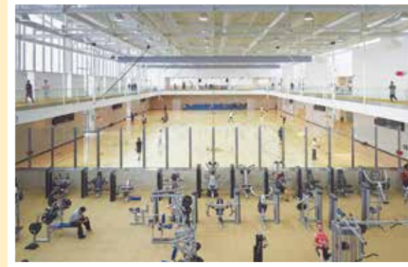
The weight room and ball courts at the Student Recreation and Wellness Center

"I love the campus; Cal State Long Beach has a variety of programs, and the people here are so nice."