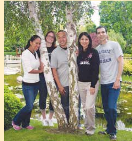
The Japanese Garden