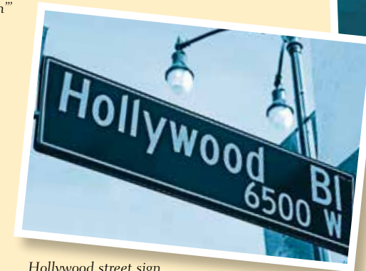
Hollywood street sign