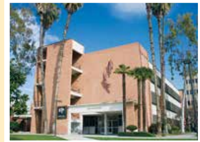
Clockwise from the top: the Molecular and Life Sciences Center; Engineering Building #2; the CSULB Library; dancers practicing at the Dance Center