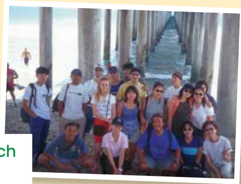
American Language Institute students at the beach

Top: Restaurant at the Long Beach Museum of Art; Left: downtown Long Beach at night