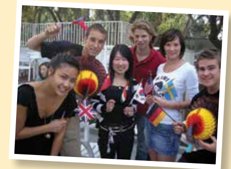
Students share a lighthearted moment

*Check with International Admissions for availability. Please check on a graduate program's website, as some graduate programs have earlier application deadlines.