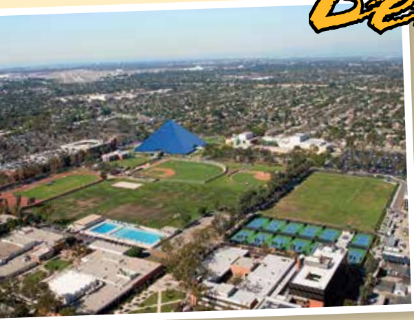
Aerial view of CSULB campus

Located just 4.8 kilometers from the ocean, California State University, Long Beach (CSULB), known as The Beach, offers a vibrant, diverse environment for international students. With the best of Southern California's attractions just around the corner—