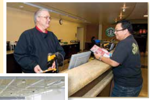
The University Library

Founded: 1949 Size of Campus: 130.71 hectares Students Enrolled: 35,000+ Students Living On-Campus: 2,500 International Students: 1,400 ESL Students: 900 Average Class Size: 30 Student-Teacher Ratio: 21-1 Number of Colleges: 8 Bachelor's Degrees: 87 Master's Degrees: 67 Doctoral Degrees: 4