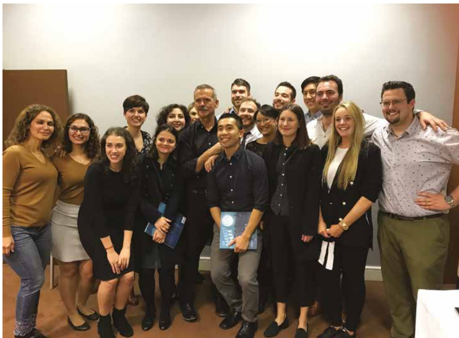
Pictured: Chris Hadfield (centre) with GEMS students at Gig for Ghana.