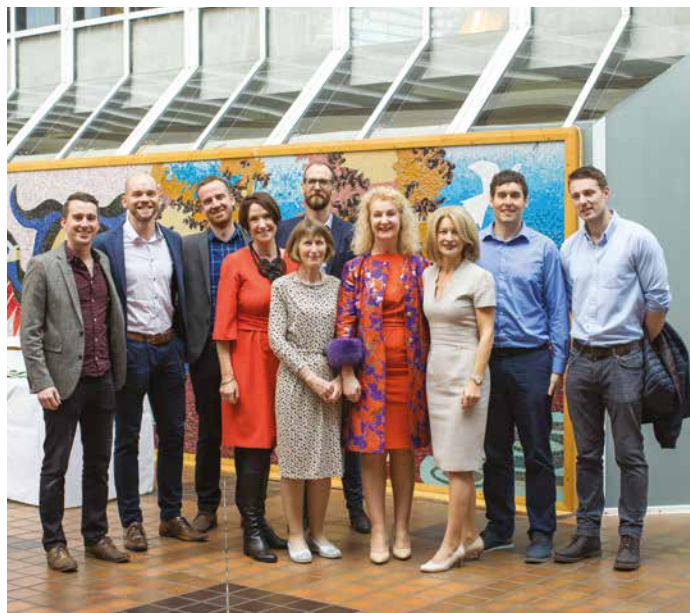
Alumni and Faculty from the GEMS 2007 original intake class.