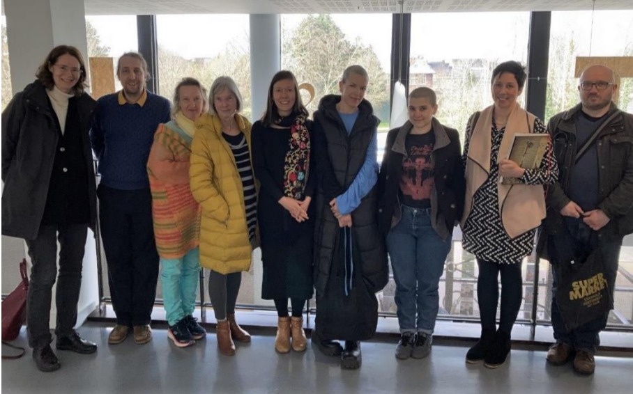
Participants and contributors to the art project inspired by Erich Kästner's 'The 35 th of May'.

project, Clare-based artists were inspired by Kästner's work to produce pieces of art then to be presented and discussed by the