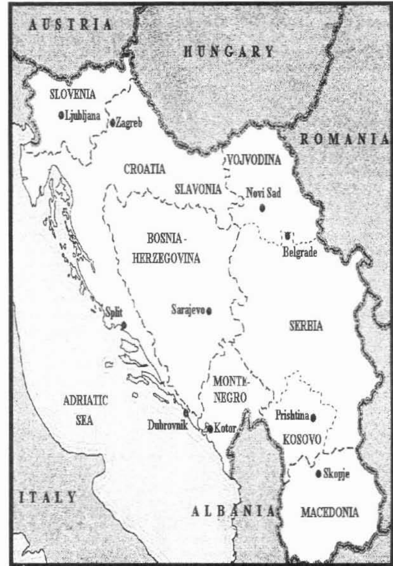
Fig. 1. Yugoslavia 1991.

stripped of its 'autonomous' status and by the time Slobodan Milosevic gave his fateful speech at the Field of Blackbirds on the feast day of the Kosovo martyrs, 28 June 1989, the delusion of 'Yugoslav unity' had evaporated. Slovenia, which had begun the push for independence in January 1990, ceded from the federation in May 1991. When Croatia followed in June 1991 the Serbian response plunged the Balkans once more into the abyss.