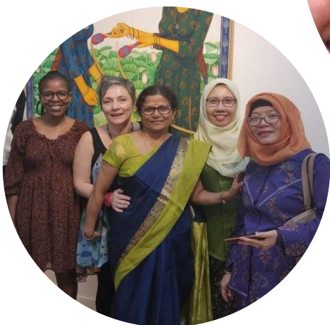
K4C Consortium meeting, PRIA, India

Since its establishment in 2015, UL Engage has sought out international collaborators who share our approach. Following a strategic alliance with University of Massachusetts Boston to develop graduate level community-based learning in 2018, the Association of International Education Administrators (AIEA) chose the University of Limerick for their Thematic Forum 'From Serviced Learning to Engaged Learning' . In the same year, the University of Limerick was invited to join the UNESCO sponsored Knowledge for Change (K4C) global consortium for Community-Based Research and Social Responsibility in Higher Education. This was followed, in December 2019, by an invitation to join the Executive Board of the International Federation of Workers Educational Associations (IFWEA) a global network of not-for-profit and third sector organisations dedicated to promoting lifelong learning, democratic practice, justice and equality for all. Throughout 2020, these networks sustained our international reach providing an opportunity—despite the COVID-19 pandemic—to use the time to plan for further international collaboration throughout the forthcoming year.