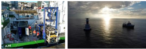
Mobilisation Cork harbour. Operations at Kish Lighthouse