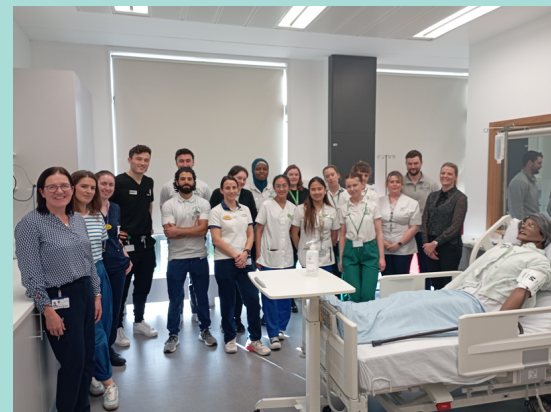
Students & Facilitators at the Interprofessional Education Series, Simulation Lab, CERC, UHL.

Interprofessional education is an important part of preparing health sciences students for post-registration working in multi-disciplinary teams. It is generally considered that when healthcare professionals share aspects of their education, this will also result in improvements to patient care because the qualified professionals will communicate more effectively, and understand each others' roles more clearly. The Health Sciences Academy provide an important focus for Inter-professional education.