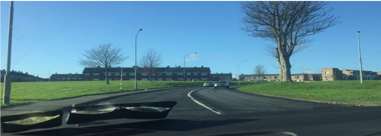
The picture above is of the Moyross Estate itself.