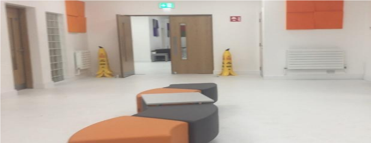
The picture above is of the inside of the build which as you can see is very modern.