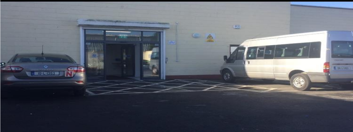
The picture above is the entry to the Bayze in Moyross, where we would have all of our meetings.