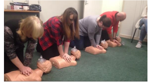
Members of the first aid training class held in Limerick performing CPR.