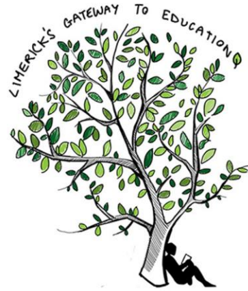
This is the logo that the Limericks Gateway to Education Uses.