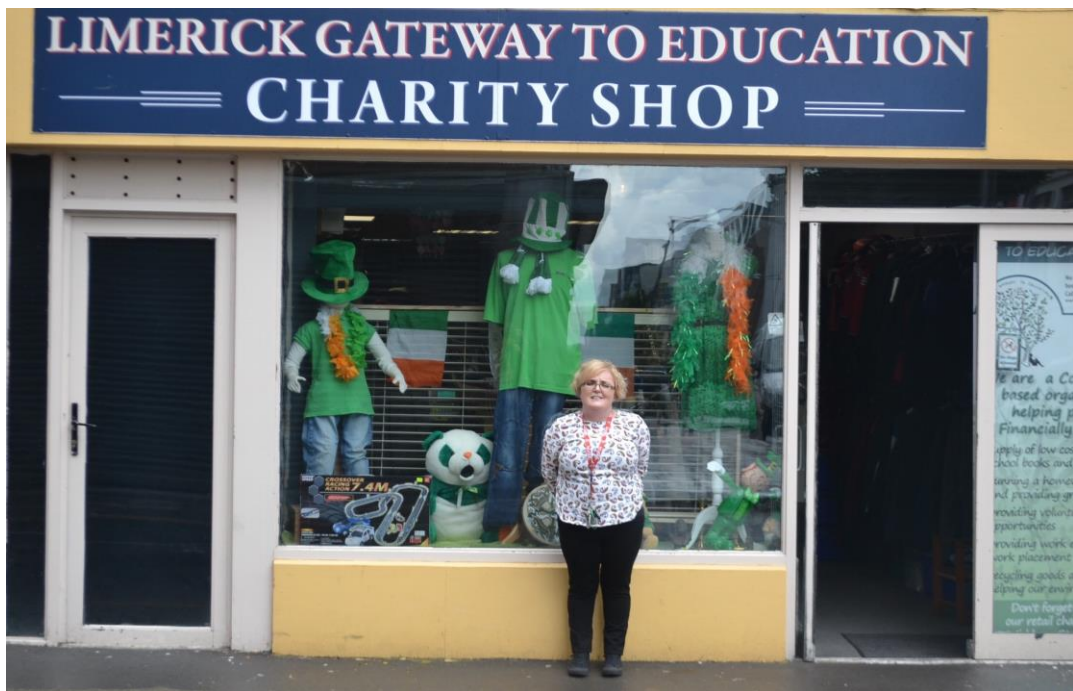
Above shows a picture of the actual shop itself.