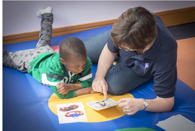
St. Gabriel's works to form strong relationships between our children and caregivers.