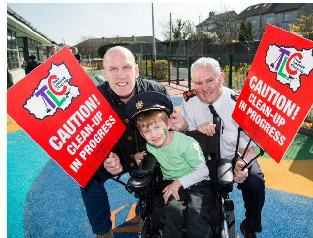
Community ambassadors on a recent visit to St. Gabriel's School