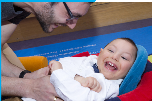
Smiles all around!