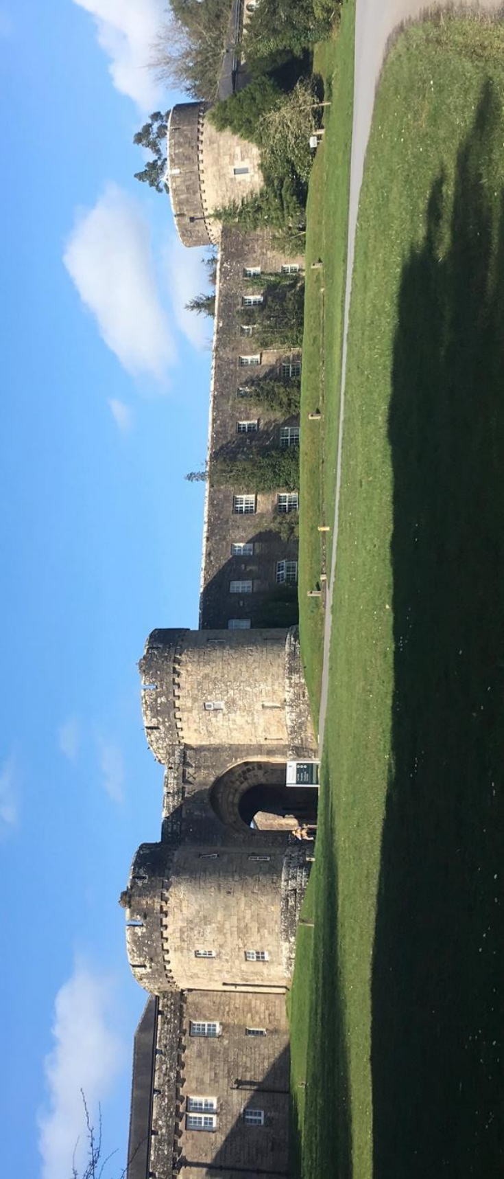
Figure 1: Entrance to Glenstal Abbey Glenstal