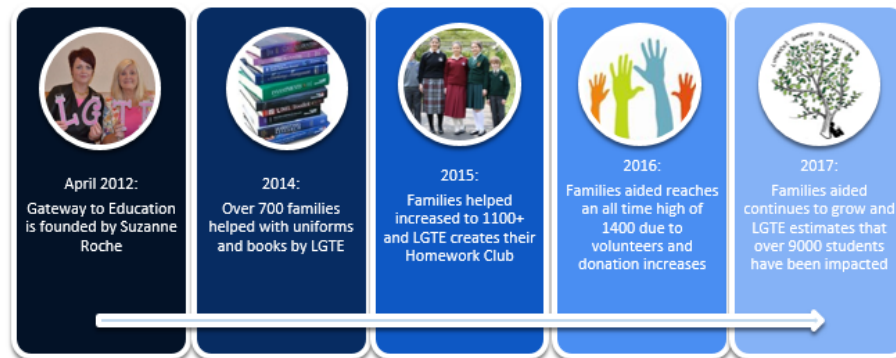
Figure 1: Store Growth Timeline

Limerick's Gateway to Education is a Limerick-based educational support charity that offers school books, uniforms, and tutoring services to local families who would otherwise struggle with the expense of sending their children to school. In order to pay for its overhead, LGTE also sells second-hand books, movies, clothing, and shoes in its shop and relies on donations to receive these items. LGTE also runs a Homework Club, where university students provide affordable tutoring services to local children.