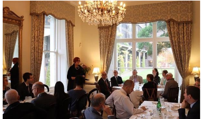
Lunch at Plassey House