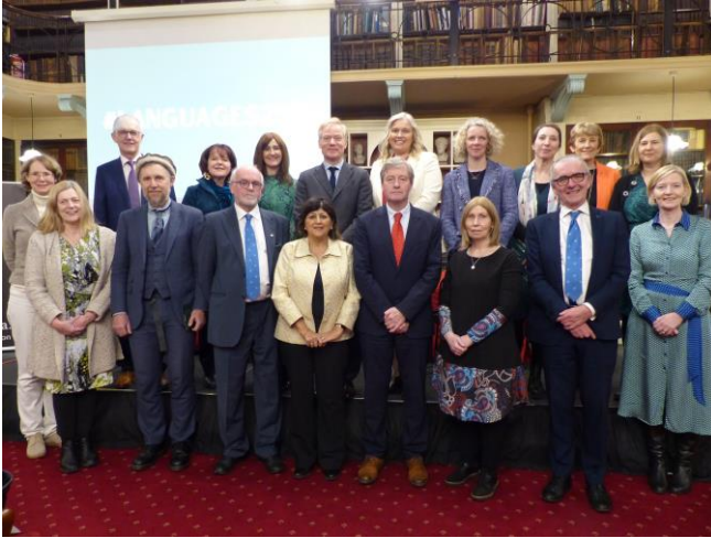
Speakers and organising committee

The Centre for Irish-German Studies is proud to support the excellent initiative #languages250 – with the next events coming up in Belfast in November 2024, in Limerick in 2025 and in 2026, in time for the 250th anniversary, Trinity College Dublin.