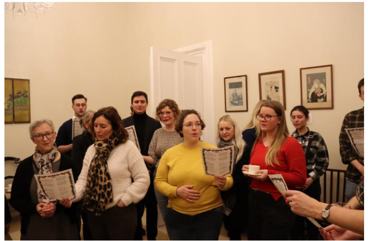
Great Christmas carol singers