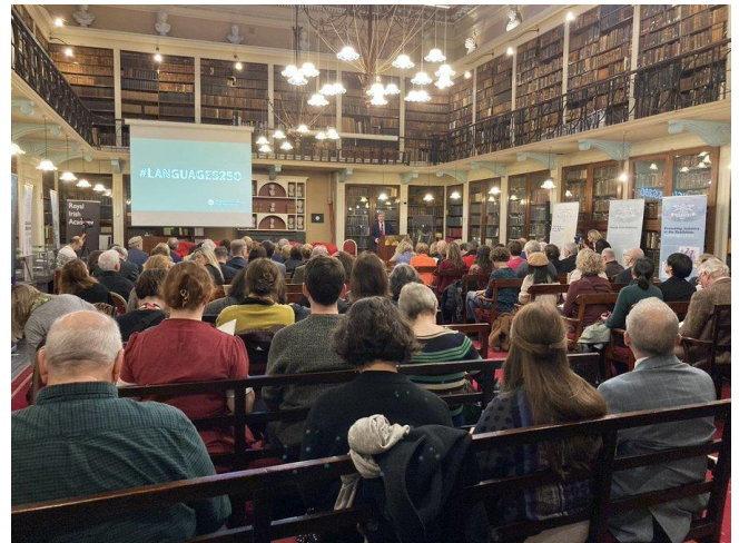
Guests at the fully booked RIA event