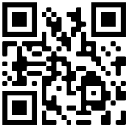
Instruction video on how to upload documents